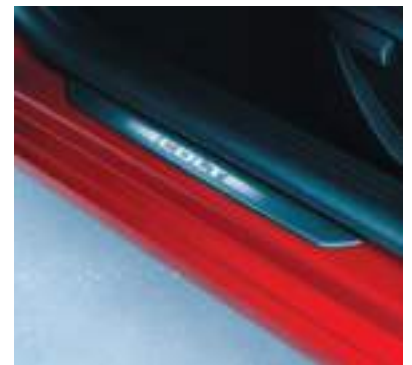
▲ Entry guard Also available with illumination.