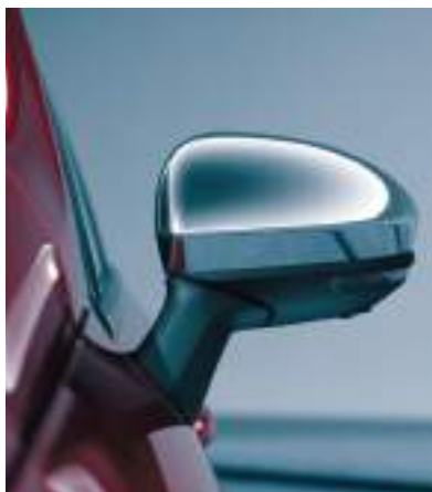
▲ Door mirror cover Chrome.