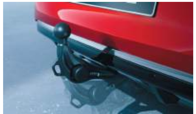
▲ Towing solutions Fixed, detachable, retractable.