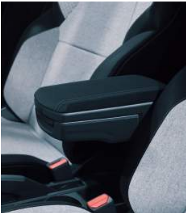
▲ Armrest storage space