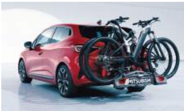
▲ Bike carriers Multiple models available.