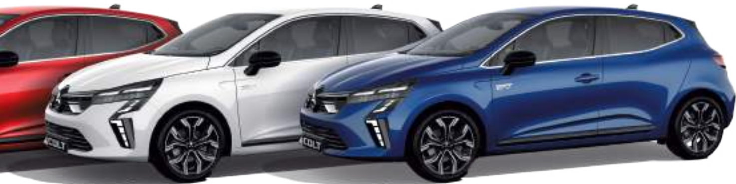
Artic White Solid ▲

The new COLT is available in a striking range of colours. Choose your preferred look by selecting one of these striking and sophisticated options.