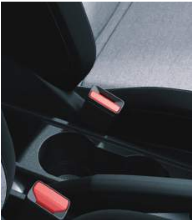
▲ 2-Cup holder