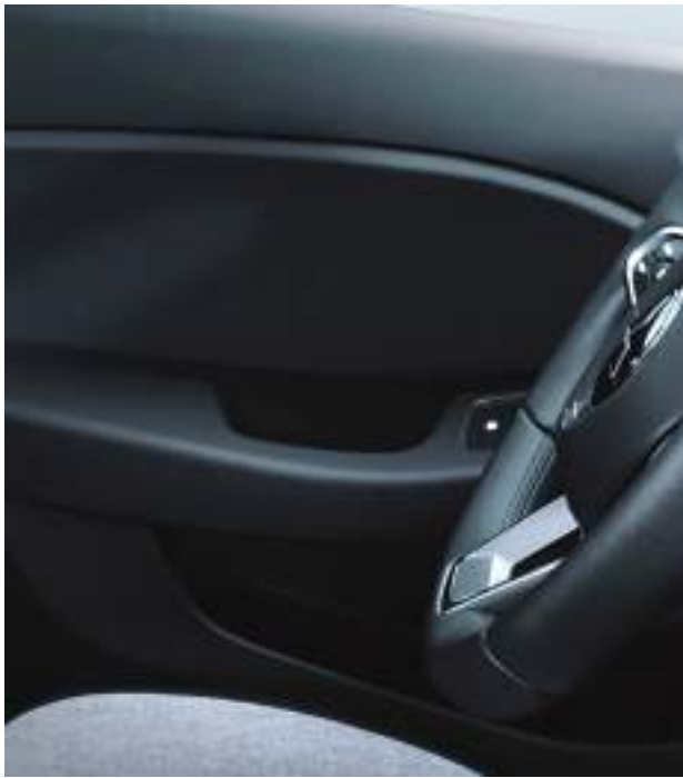
▲ Door pockets