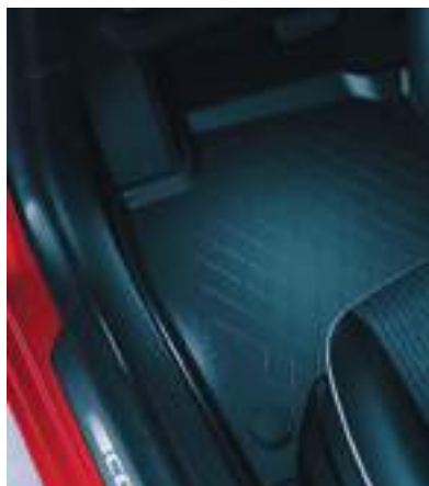
▲ Rubber mat set