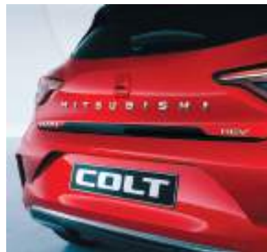
▲ Tailgate garnish Multiple colors available.