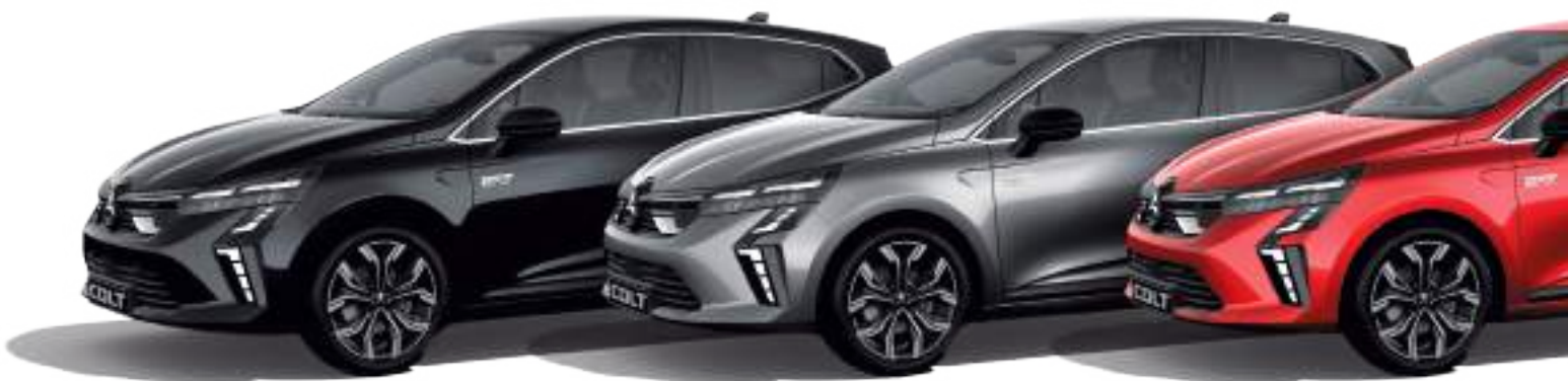
Onyx Black Metallic ▲

The MULTI-SENSE system allows you to personalise many of the COLT's settings. Choose from 3 driving modes: Eco, Sport and My Sense. For full personalisation, change the steering mode and set the ambient lighting. You can also personalise the graphic display on the instrument panel in front of the driver.