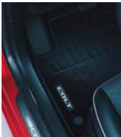
▲ Textile mat sets Comfort or Elegance.