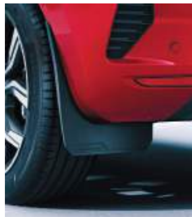
▲ Mudguards For front and rear.