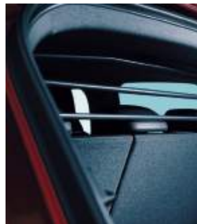
▲ Seperation rack Black coated.