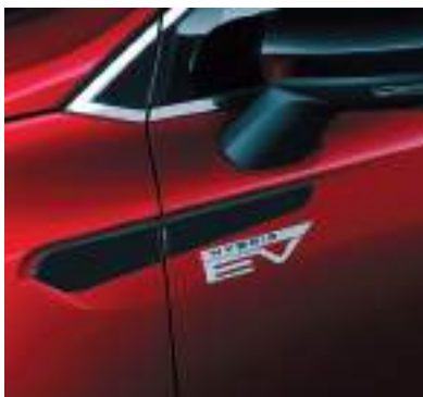
▲ Side garnish Multiple colors available.