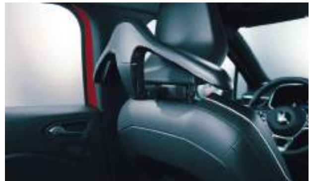
▲ Travel & Comfort System Multiple attachments available.