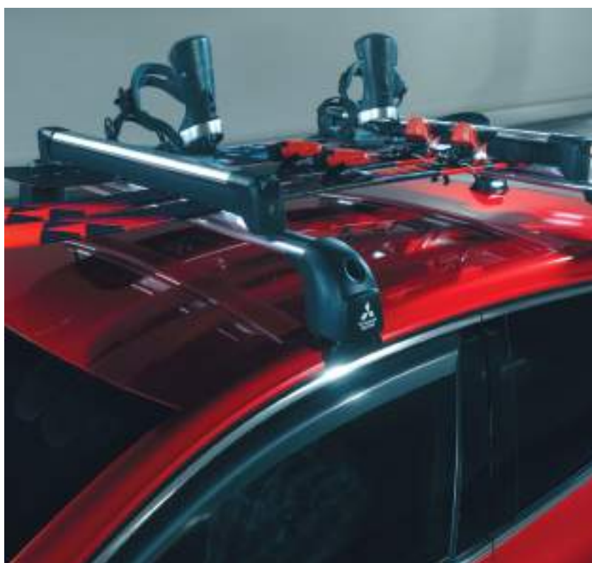
▲ Roof base carrier Wingbar type.