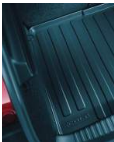
▲ Trunk liner Reversible.