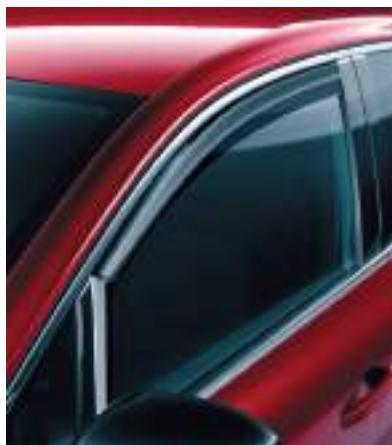
▲ Side wind deflectors Front windows only.