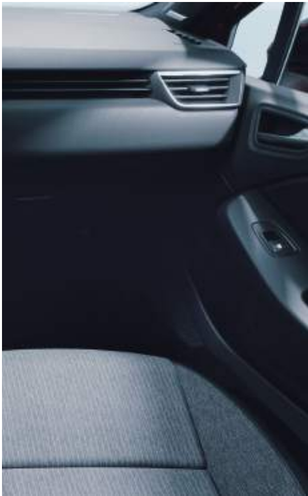
▲ Glove compartment

The All-New COLT is always ready and roomy with a 2-cup holder between the front seats and further storage space under the armrest. The door pockets hold 1.5-litre bottles, and the glove compartment has a huge 8.0-litre capacity.