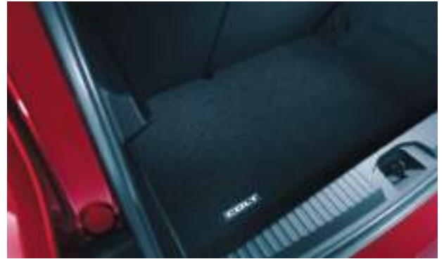
▲ Trunk mat With COLT Logo. Easy installation.