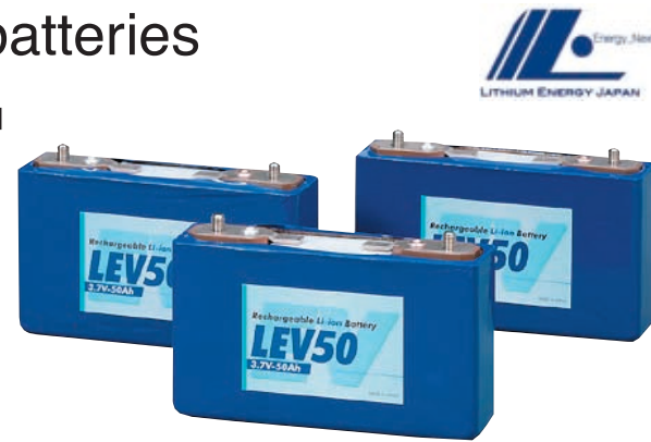
Large lithium-ion batteries (cells)

GS Yuasa is currently the only mass producer of large lithium-ion batteries in Japan. The new company will produce batteries with substantially improved performance and higher capacities suitable for EVs.